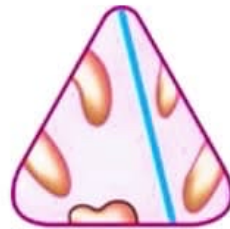
Caudal (Anterior) septal deviation